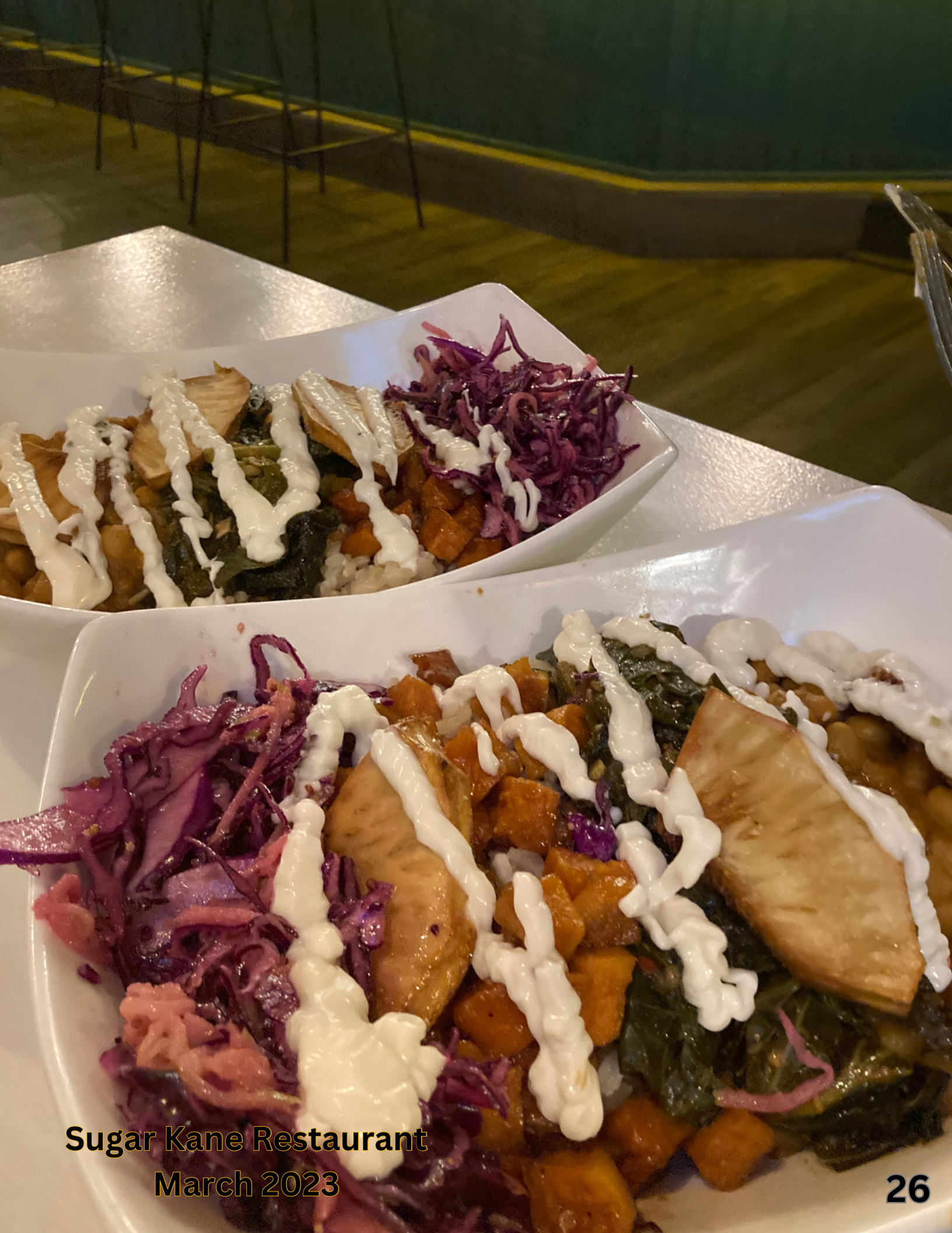
Sugar Kane Restaurant March 2023