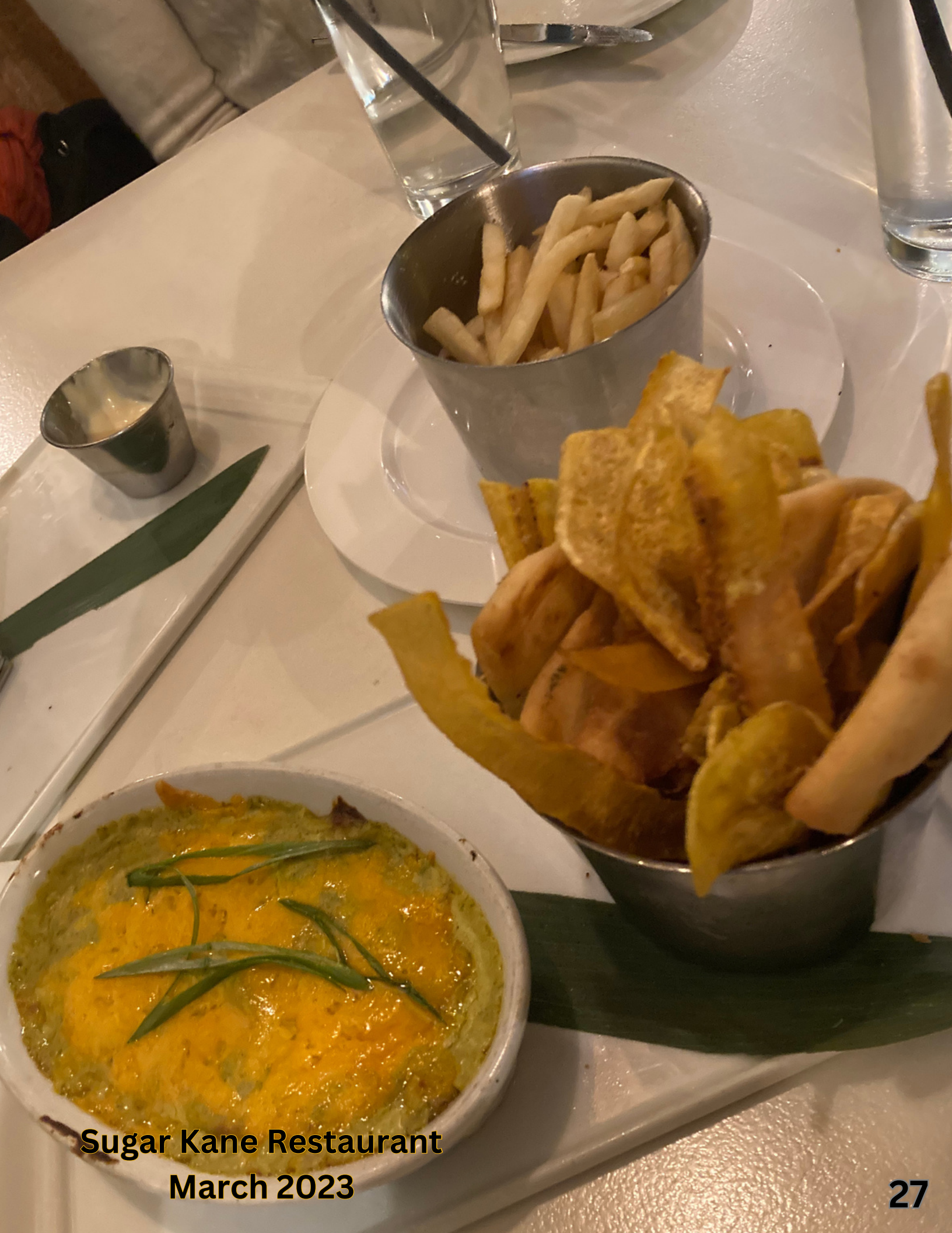
Sugar Kane Restaurant March 2023